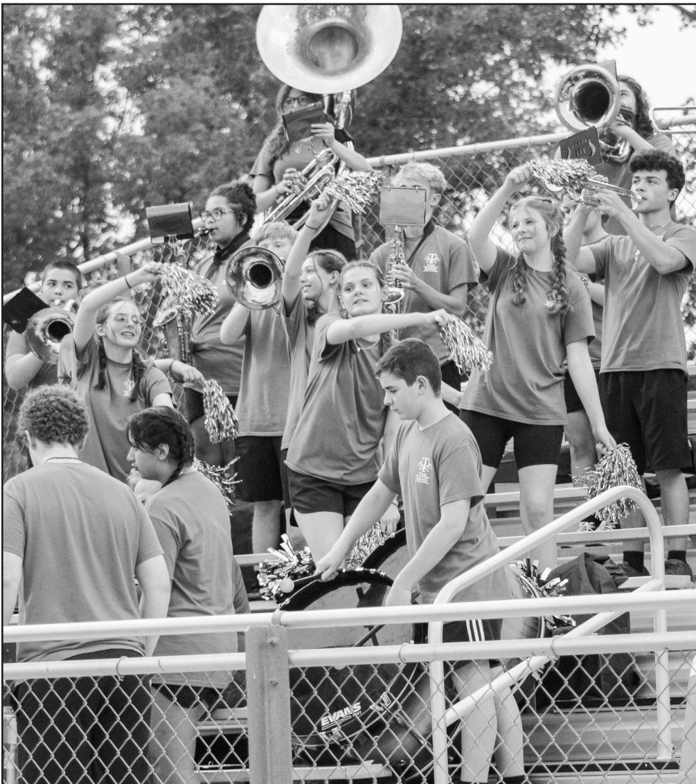
The TCHS band made the trip to Gainesville last Friday to support the Indians at Lakeview Academy.

Even in the face of a defeat, the Roc is more positive than ever. "We've got some notable season statistics already."