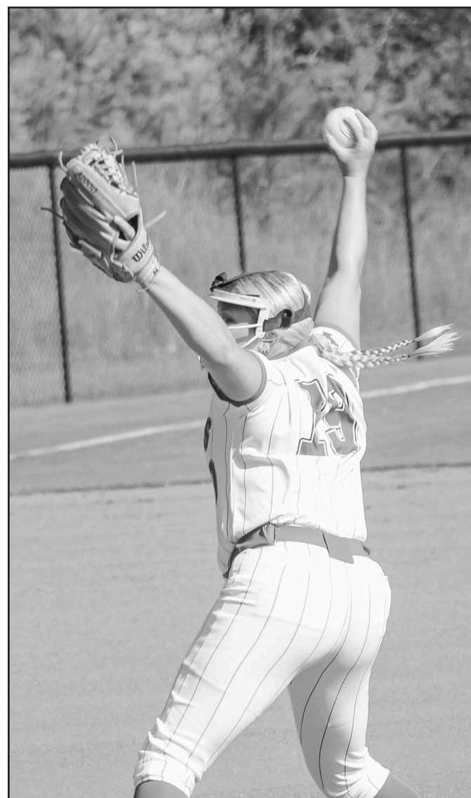
The Lady Indians can move 2 games over .500 for the first time in 2024 with a win over Cedar Shoals on Tuesday.

The best you can do is reinforce basic hygiene habits (which young kids can struggle with) and make sure everyone in the house is eating healthy, sleeping well, and exercising regularly. And definitely don't send your kids to school when they're sick — they'll just pass