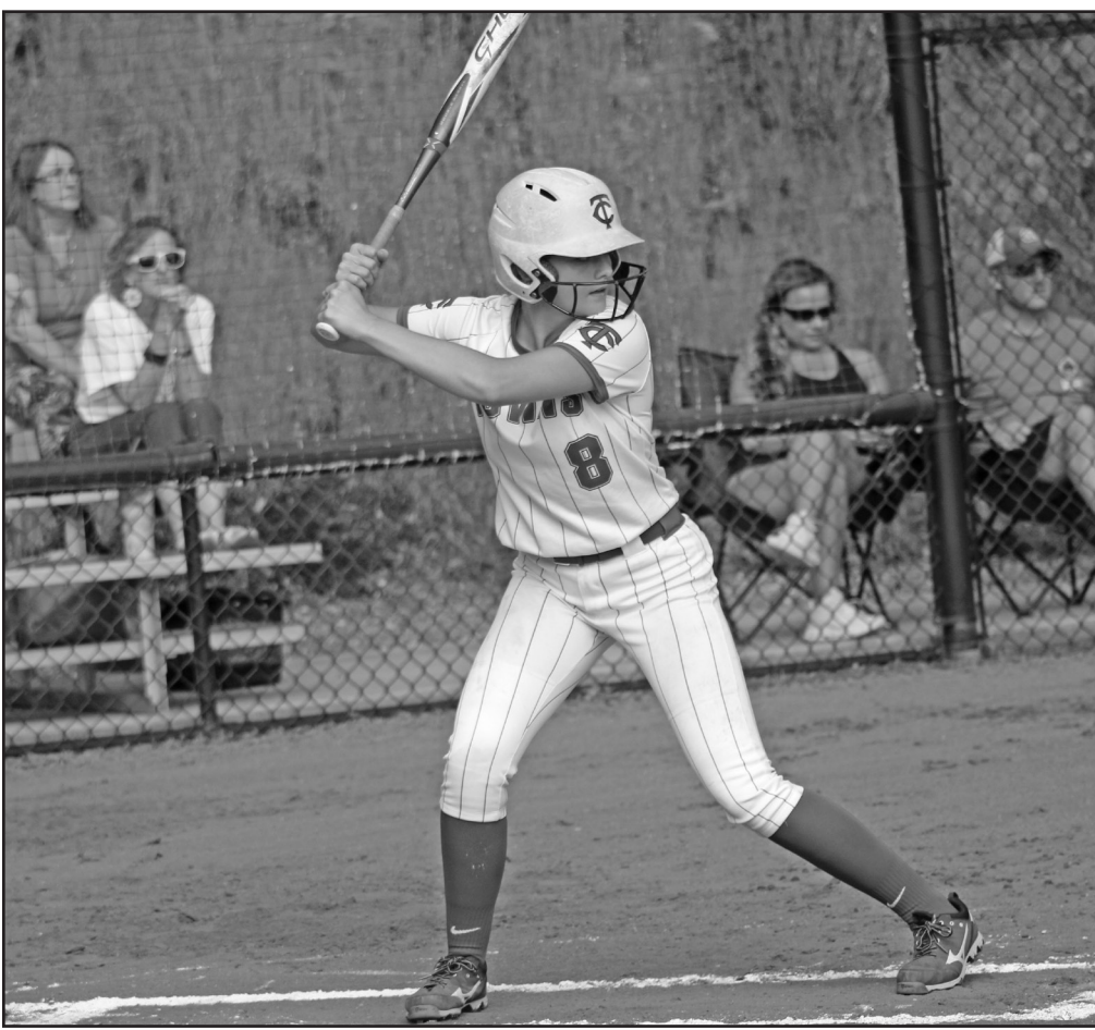
The Towns County Lady Indians exploded for 11 runs in a win at Gainesville last week to improve to 4-3 on the year.

"Overall, it was a tough week. We only had 9 players healthy enough and available for Monday's game and couple of those were not feeling their best. I am proud of the perseverance they displayed. We are thankful for the win and